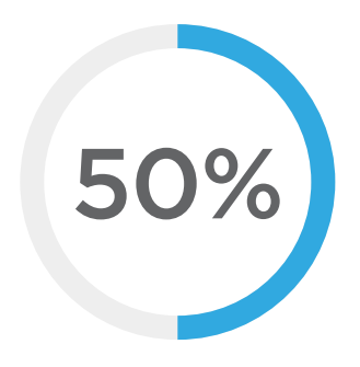
Percentage automate some but not all functions