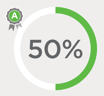
Percentage use Orchestration