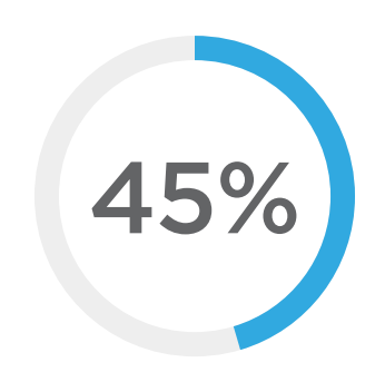
Percentage have a high level of automation