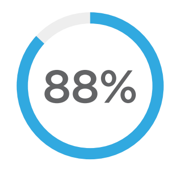
Percentage agree automation has improved their staff's technical skills and general knowledge of cybersecurity