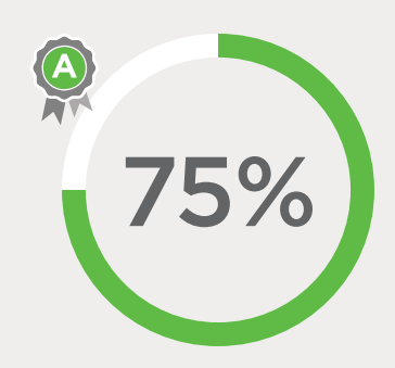
Percentage use Anti-Phishing or other messaging security software