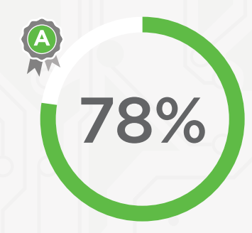
Percentage have a full in-house SOC

With an increase of in-house SOCs comes a rise in formalized training for security staff. Companywide programs to keep IT staff up to date on the latest threats and trends are up over 10 percent since 2017 to 63 percent today. The value that formalized training brings to an organization's security program is becoming more recognized. In 2017, twenty percent of respondents claimed no use or need for a company-wide training program to continually educate IT staff—that number has decreased to only 10 percent today.